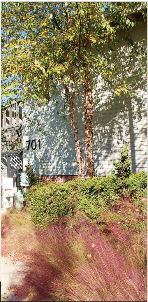
Top, 701 W Trinity Exterior: Previously leased 701 West Trinity Avenue #101 and #115, priced respectively at $579,000 and $324,900, are currently available for sale.