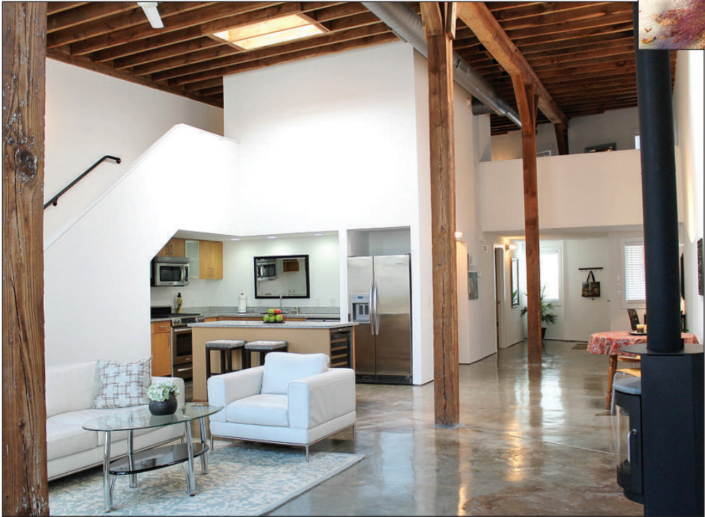
Left, Living Room – Kitchen: Located at the corner of Downtown Durham's West Trinity Avenue and Washington Street, Trinity Lofts features consummate Soho and Tribeca living, with expansive spaces, 17' ceilings, polished concrete and bamboo flooring, and exposed original timbers and brickwork.