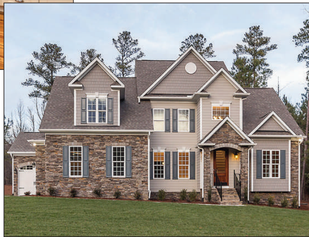
The Sunbury by Cimarron Homes is a stunning 2,972 square foot plan of 5 bedrooms, 3.5 baths and a 3-car garage.