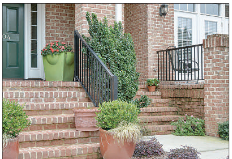
CONTRIBUTED PHOTOS Among an abundance of outstanding features, all homes include brick exteriors, street-front parking, and rear-entry garages.

Commons unfolds... We're very pleased to have entered the Triangle new homes market."