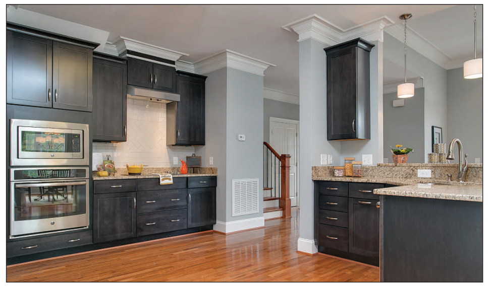
Interiors include granite or quartz kitchen and master bath countertops, custom cabinetry, GE Profile appliances, hardwoods, ceramic tile, crown molding in every room, plenty of storage and smooth ceilings ranging from 9 to 11 feet.