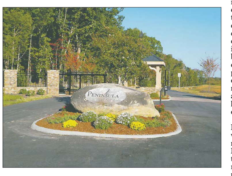
A boulder unearthed from the property has been etched with the community logo at The Peninsula's gated entrance.

Henderson, Highway 39 North toward Kerr Lake. Travel approximately 13.2 miles; turn right on Rock Spring Church Road. The entrance to the community is on the right. By water on Kerr Lake, the property is located between Buoys F and G. Visit www.LotsAtKerrLake. com for more.