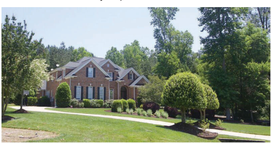
"In a word, this home is stunning," says Sarah Artz. "It's positioned on a large lot with an abundance of lovely landscaping. The all-brick exterior only hints at the distinctive quality found inside."

At the heart of 59 Crooked Creek Lane is an epicurean kitchen with all the works, including lustrous cabinetry, granite countertops, bar seating, ceramic tile backsplash, a roomy pantry, lots of counter and storage space, and