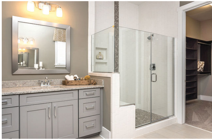
Spacious rooms, 10-foot ceilings and semi-frameless shower enclosures are featured in the 5401 North master suite.

Looking for an exciting new concept in urban living? Meet 5401 North, Wake County's 400-acre master-planned community at I-540 and US-401 North. The residential development and new home construction at this new lifestyle-centered community is underway by award-winning Level Homes, based in Baton Rouge. Craftsman-inspired single-family homes of 1,363 to 3,463 square feet are in various stages of construction, with several homes ready for move-in.