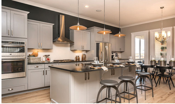
Hardwoods and stainless steel GE Profile appliances reflect metropolitan allure in the kitchen.